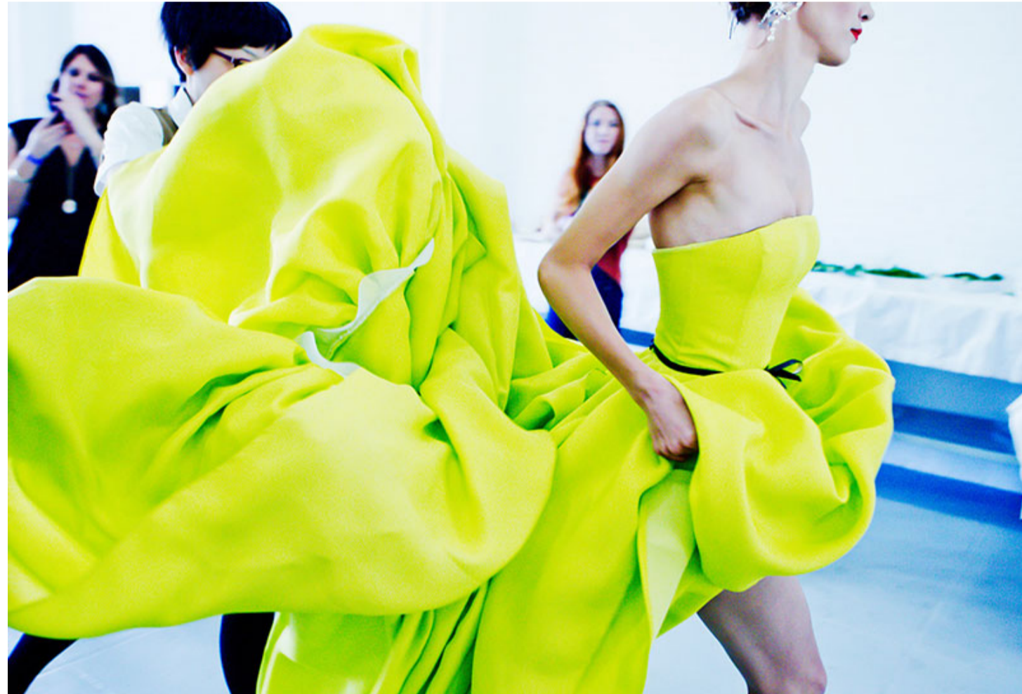
Figure 2. Chartreuse Dress by John Wu