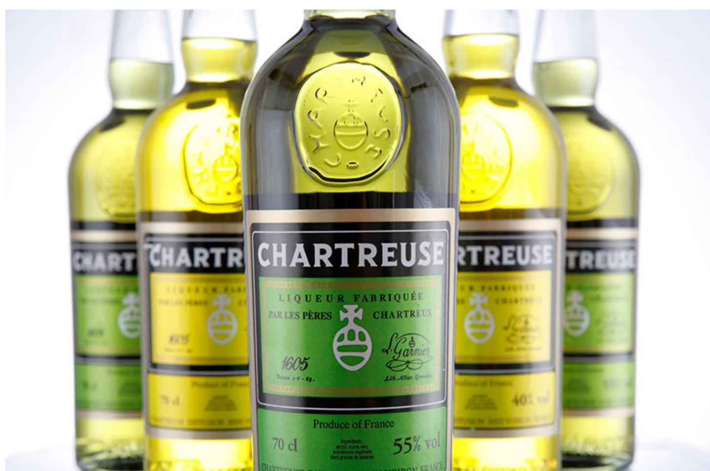
Figure 3. The famous Chartreuse liqueur, "the only liqueur in the world with a completely natural green colour"