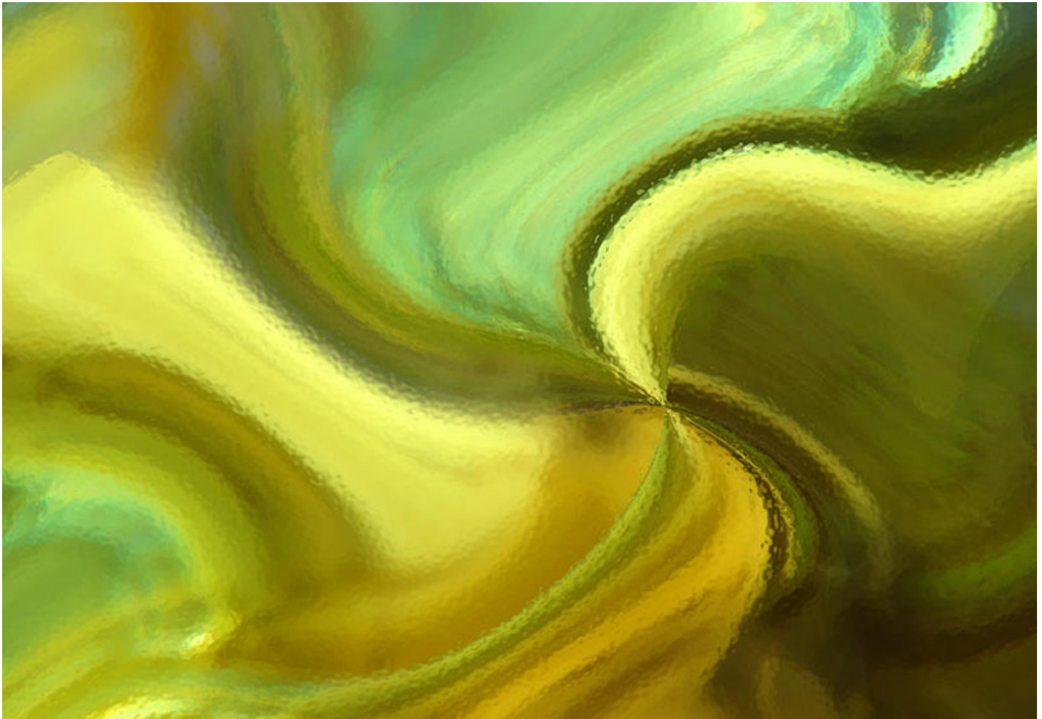
Figure 1. Chartreuse Series Abstract VII by Ginny Schmidt

Other visual examples of Chartreuse can be found in Figure 1, Figure 2, and Figure 3.