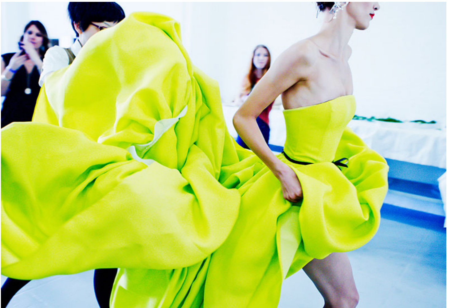
Figure 2. Chartreuse Dress by John Wu