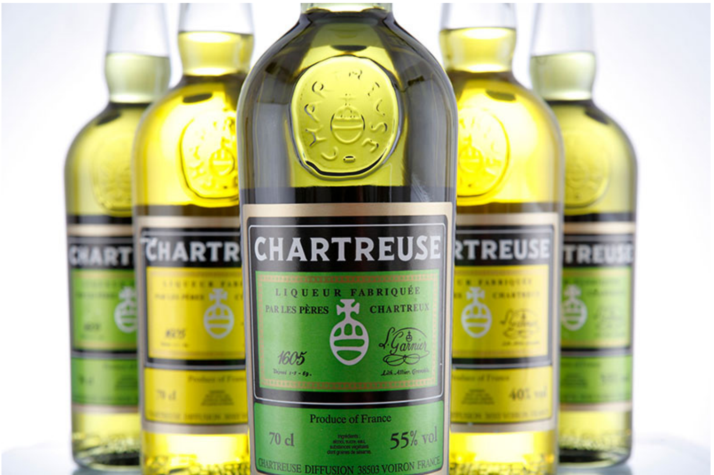
Figure 3. The famous Chartreuse liqueur, "the only liqueur in the world with a completely natural green colour"